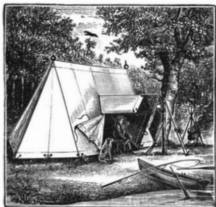
THE CAMPER'S FAVORITE TENT.