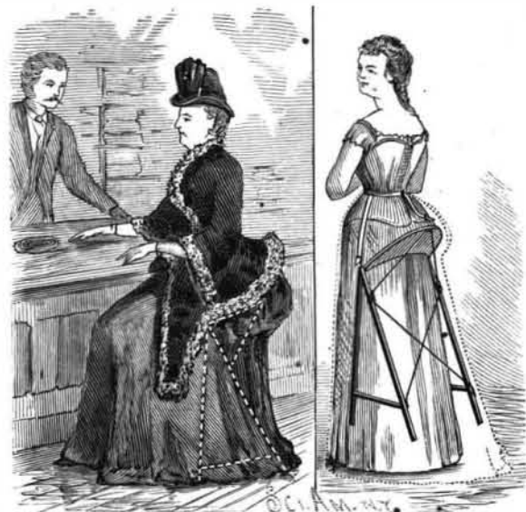
COMBINED STOOL AND BUSTLE.

So long as it is the fashion for ladies to wear bustles of the pronounced amplitude now favored by so many of the fair sex, we do not see why the fact may not be taken advantage of to introduce an invention calculated to make it convenient for them frequently to rest