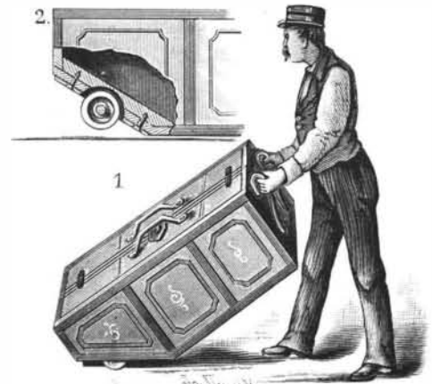
AP ROBERTS' NOVEL TRUNK.

cycle, and is intended for the rapid transport of infantry from one point to another. When fully manned, it carries twelve men, who can take with them, if necessary, a light baggage cart or ammunition wagon. By thus mounting the riders in single file, instead of two or four abreast, the machine is both rendered more manageable and it also presents less surface to a strong head wind. The speed got out of this machine is surprising. Ten miles an hour is a low average rate, and sixteen have been easily accomplished. It is less affected than any other velocipede by rough roads, and passes easily over a newly metaled track. All the tires are wired on the Otto principle, so that they cannot be greatly damaged by cuts from sharp stones. The whole control and steering of the machine is in the hands of one man, who found no difficulty in managing it even in the most crowded streets. It turned easily in less space than a hansom would have needed, and threaded its way among numberless vehicles without mishap. The crew in charge of this multicycle are all trained volunteers, who will be able to execute intelligently any military evolutions which may be demanded of them. The machine is now being severely