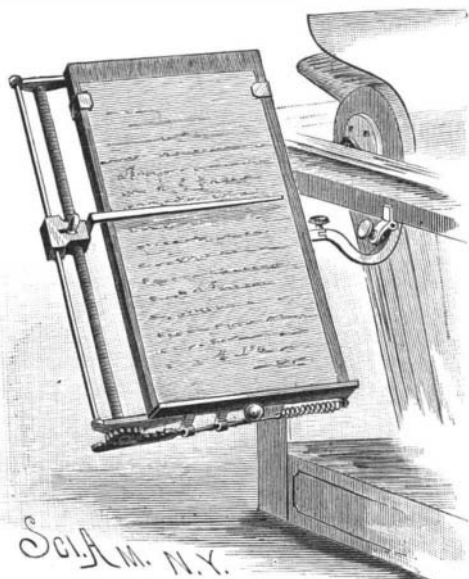
MERRILL'S NOTEBOOK HOLDER AND INDICATOR.

By means of a collar held by a set screw on the bar, it is possible to regulate the extent of movement of the rod, for turning the screw more or less to shift the line indicator a greater or less distance, as required by the space between the lines of copy. Held in the outer ends of the lugs, parallel with the screw, is a rod, on which the head piece of the indicator is fitted to slide and turn. The base of the head is formed with half threads, held in engagement with the screw by a properly arranged spring. The indicator may be re-