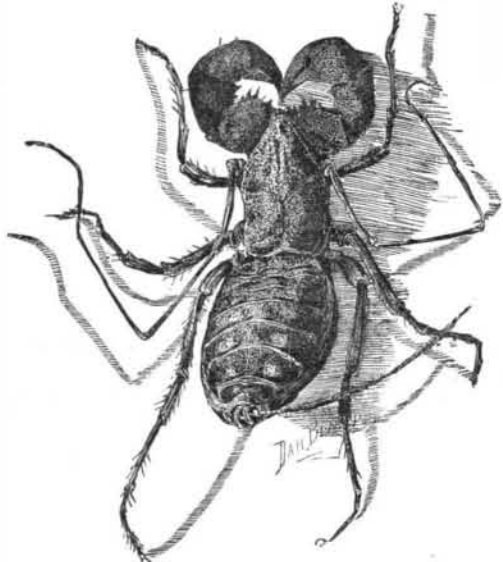
WHIP SCORPION ( Thelyphonus giganteus ).

Amid the tangled underwood in the dark damp, re-