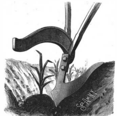
BOURNE'S IMPROVED CULTIVATOR.