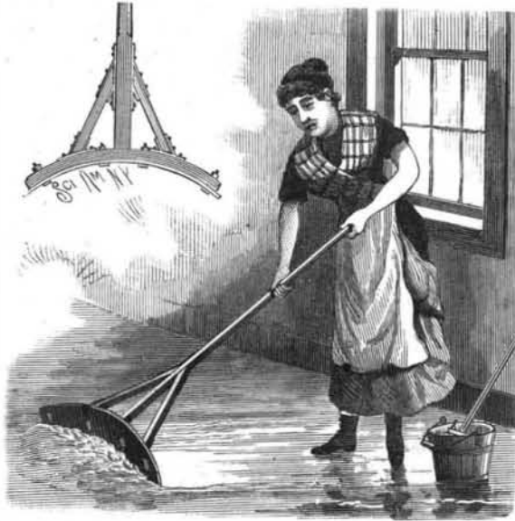
KAE LIN'S FLEXIBLE SCRAPER.

To the end of the handle is secured a concave board, having its opposite edges curved. To the back of the board are secured metallic sockets for receiving braces, which are held in sockets secured to the handle. This construction insures both strength and lightness. To the concave face of the board is attached an oblong sheet of rubber, whose edges project beyond the edges of the board, so that when the scraper is used only the rubber will be presented to the floor or surface being cleaned. By applying the scraper to the floor at the proper angle, the entire edge of the rubber sheet will be brought in contact with the floor, and as the scraper is moved forward its concave form will cause it to re-