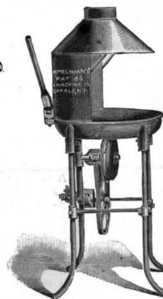
Fig. 2.—THE STAR BLACKSMITH'S FORGE.

that, owing to the direct method of applying the power, and the minimum amount of friction, almost all of the force applied to the lever is transmitted to the blower. The clutch has very few pieces, and is so designed that there is practically no wear. Another advantage is obtained by the employment of steel shafting and by babbitting the journals.