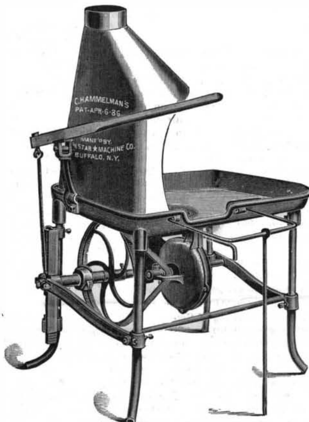
Fig. 1.—THE STAR PORTABLE FORGE.