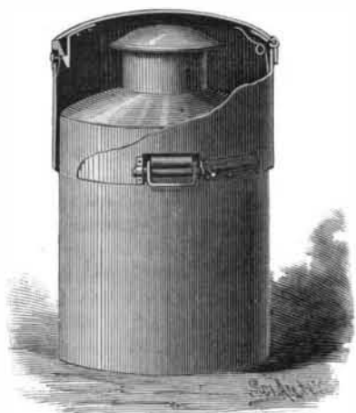
DOUGLAS' DETACHABLE MILK CAN REFRIGERATOR.

On the upper part of the milk can fits a case, the lower edge of which is recessed to receive the handles. Hinged to the top of the case is a cover, which is raised by a spring and held closed by a spring catch, as shown in the engraving. By pressing upon a properly arranged knob the catch may be disengaged, when the cover will be instantly raised by the spring. The case is held in place by bolts, which may be placed across the recesses, so as to be below the handles on