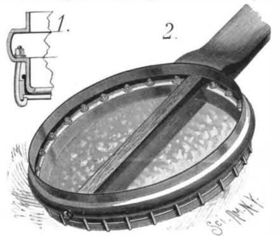
DOBSON'S BANJO FRAME.

The banjo frame herewith illustrated is so constructed that the head-holding hooks are prevented from tearing the clothes of the person playing the instrument. The frame is made of metal, and is provided with a hollow head forming an internal annular groove. In the annular shoulder thus formed by the top of the head are holes, through which are passed the lower screw-threaded ends of the clamps, the hooks of which engage the upper edge of the usual ring sur-