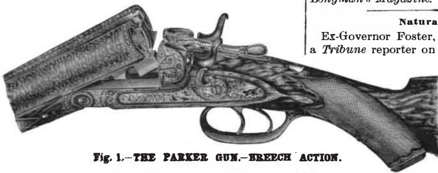
Fig. 1.—THE PARKER GUN.—BREECH ACTION.

In the manufacture of laminated steel barrels, the best quality of steel scrap is mixed with a small proportion of charcoal iron, heated in a furnace, puddled into a ball, well worked up under a forge hammer, drawn out under a tilt hammer into strips of the required length and thickness, and then treated as above described. Such barrels are much esteemed for hardness and closeness of grain, and show a different marking and appearance from those made by the Damascus twist.