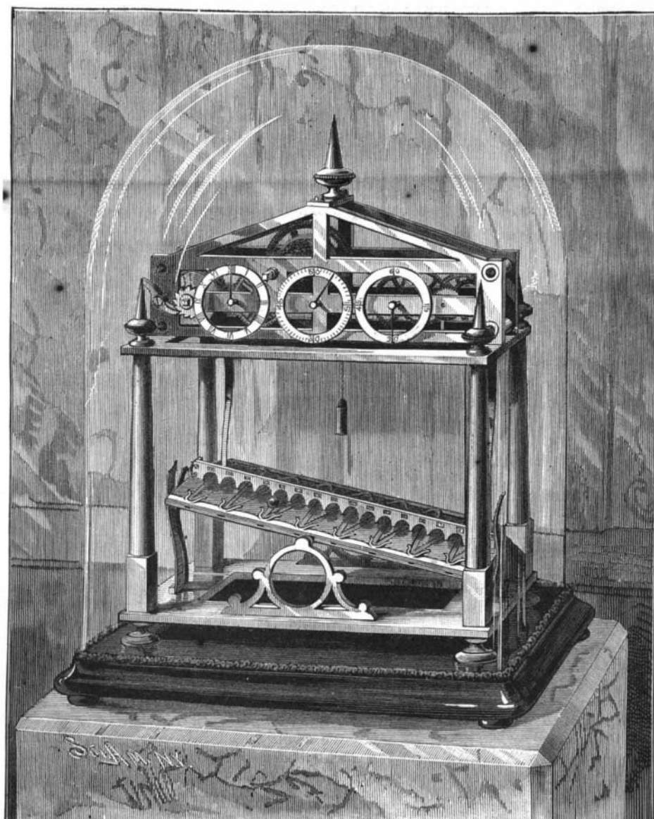
A NOVEL CLOCK.

Dr. Gilles de la Tourette has recently published a monograph upon normal locomotion and the variations in the gait caused by diseases of the nervous system. He found, from a comparison of a large number of cases, that the average length of a pace is, for men,