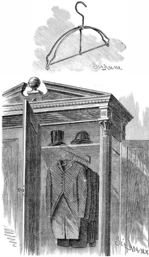
CAZIER'S WARDROBE ATTACHMENT AND GARMENT HANGER.

This wardrobe is so arranged that its available storage capacity is doubled, and any garment hung in it can be readily reached without removing any other garment hung within it. Secured to the rear end of the usual upper shelf is a metallic rod which extends forward beneath it in a line substantially parallel with it. The forward end of the rod is curved to form a