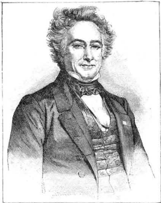
MR. CHEVREUL. (FROM A LITHOGRAPH OF 1836.)