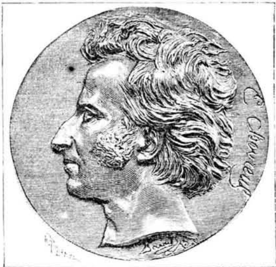
MEDALLION STRUCK IN 1839.

The number of memoirs that he has presented to his colleagues is incalculable, so to speak. He has never been desirous of being a politician, but has preferred to remain a great man and a great patriot. During the Franco-Prussian war (1870-71), at the age of eighty-six, he willingly endured the privations of the siege, and did not leave the confines of Paris. He lived at the Museum, while more than eighty Prussian bombs