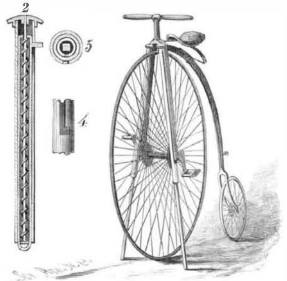
MORGAN'S BICYCLE LEG.

The annexed engraving shows a simple device—the invention of Mr. John F. Morgan, of 82 Munroe Street, Lynn, Mass.—for holding the bicycle erect when it is at a standstill. On each shank of the fork is secured a tubular casing, Figs. 2 and 3, closed at the top by a loose cap. At the outer side part of each casing is a longitudinal slot, having a notch at its lower end extending toward the rear, as indicated in Fig. 4. Within the casing is a sliding tubular leg extension, formed with a lug projecting through the slot. A square rod projects from the cap down through the center of the casing and through a square aperture