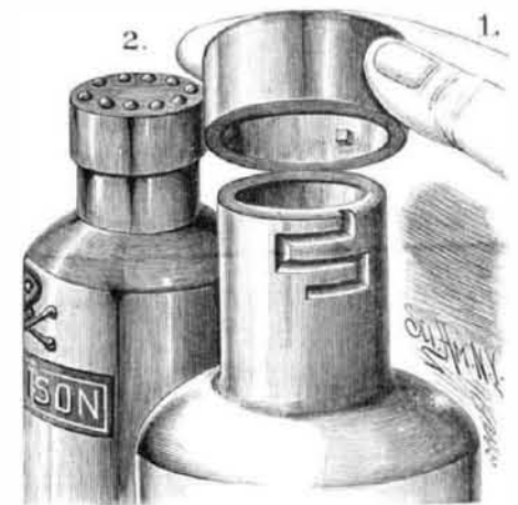
HOWELL'S IMPROVED BOTTLE AND STOPPER.

The bottle and stopper here shown are for the purpose of containing poisons, and are so constructed that a certain and more than ordinary amount of manipulation will be required before the stopper or cover can be removed. The bottle is formed with a number of horizontal and vertical grooves, as plainly shown in Fig. 1; near the lower edge of the cover is a lug. The cover is placed upon the bottle so that its lug will enter the highest vertical groove and pass