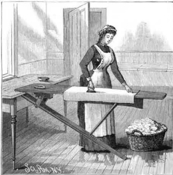
ELLISON & FEIGEL'S IRONING BOARD.

Secured near the under side of the head of the board is a transverse cleat designed to strengthen the board and prevent warping. Two short links are pivoted on the ends of a bolt passing through a block bolted to the board. The lower ends of these links are pivoted on the ends of a bolt secured in the lower leg of the board. This leg is made tapering, and is flat on its upper and lower surfaces, so that it can be used in