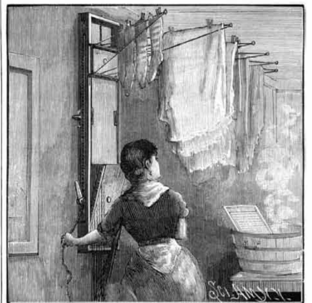
BOGLE'S CLOTHES DRIER.

To use the drier, the upper wedge-shaped block is turned on its pivot into a horizontal position and fastened by a pivoted latch, and the drying rods are spread apart to receive the clothes. The lower block may be