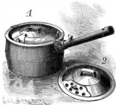
BRADFORD'S SAUCEPAN AND COVER

As generally made, the perforations in the main cover of a saucepan are closed or exposed by a supplementary lid (Fig. 1), which is a self-opening and closing one, according to the position in which the