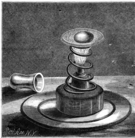
THE SPHEROIDAL STATE OF WATER.

A cup of bright metal, preferably of considerable thickness, is to be provided. This is most readily made