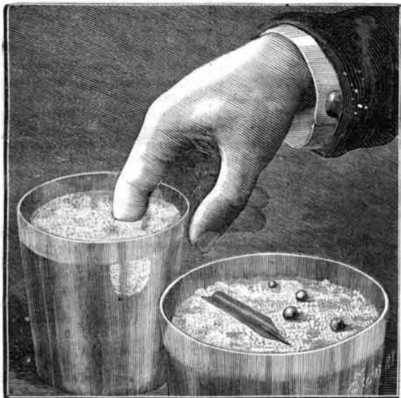
EXPERIMENT WITH LYCOPODIUM.

Lycopodium is a fine powder, the seed, or more correctly the spores, of a club moss. These are members of a curious family of cryptogamous plants that, from the demand in commerce for the spores, have a certain importance. They form the living representatives of a once numerous and important group of large trees, now mostly extinct—the lepidodendrons and sigillarias. In the carboniferous ages these plants grew to immense size, and it is supposed that in the moist air laden with carbonic acid gas their growth