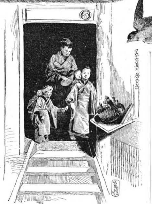
BIRDS IN JAPAN.

a national trait among the Japanese than their gentleness and kindness to children and animals.