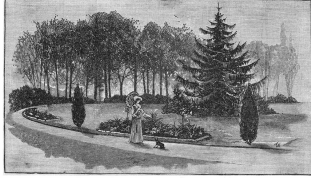
ART IN THE GARDEN.-A CIRCULAR PATH.

one point. Such walks should. wherever possible, lead to or by some bright little spots which one will come upon unexpectedly, and the surprise of which will heighten the pleasure obtainable from the beauty of the scene. An idea of thus laying out a circular walk may be obtained from the accompanying illustration, the planting of quickgrowing shrubbery giving extension and outline to a general direction of paths, which would be governed by any growth, as of trees, that would require years to mature. When a general plan has once been adopted, however, it should be carefully kept in view in all future work in the garden, and the pruning and planting kept steadily in line with the plan laid out.