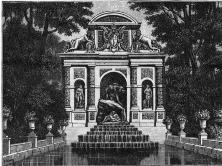
GROTTO OF MARIE DE MEDICI, THE LUXEMBOURG, PARIS.

The Forges et Chantiers Company of France have again brought forward the principle of burning liquid fuel for furnaces by means of air injectors, originally introduced by M. Sainte-Claire Deville. The use of