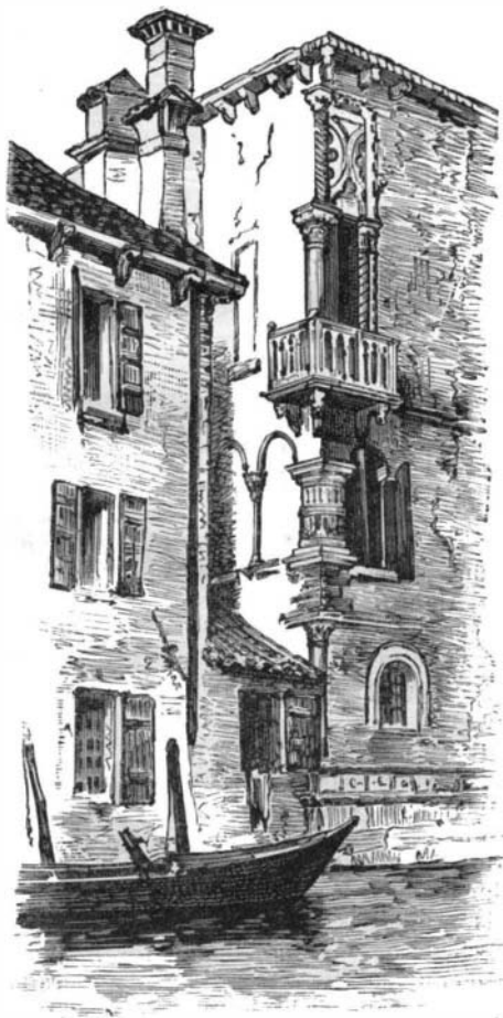
TINTORETTO'S HOUSE, VENICE, 1576.

In the picture herewith of Tintoretto's house we have a suggestion of the many-sided development of Italian art during the last days of its most glorious period. Here, before his death in 1576, in his ninety-ninth year,