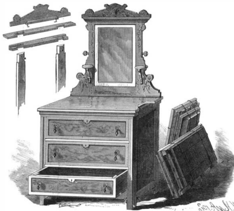
BROLASKI'S IMPROVED KNOCKDOWN FURNITURE.

The process of Brin Brothers is about as follows: First, the air is drawn, by means of a partial vacuum, through a vessel of quicklime, which absorbs all the carbonic acid and moisture, and reduces it to a mixture of oxygen and nitrogen. These gases are then drawn into the retorts, heated at 500°, and the artificial lung absorbs the oxygen, while the nitrogen is drawn off to a gasometer for conversion into ammonia, etc. The