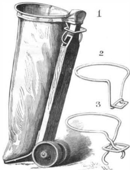
HATZ'S COMBINED BAG HOLDER AND TRUCK.

The truck board, provided at its lower end with wheels and foot piece, has its upper end tapered to form a handle having a head. In each side of the lower part of the handle is a longitudinal groove. A metal rod, Fig. 3, from \frac{3}{8} to \frac{1}{2} inch in diameter, is bent to form a large loop, which may be square, circular, or oblong, and the inner ends are bent down and crossed