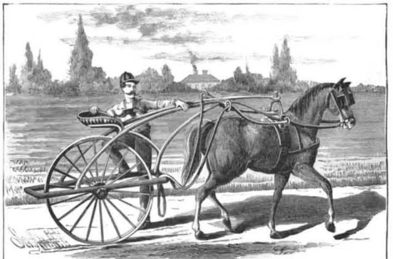
SIEBEL'S HARNESS ATTACHMENT.