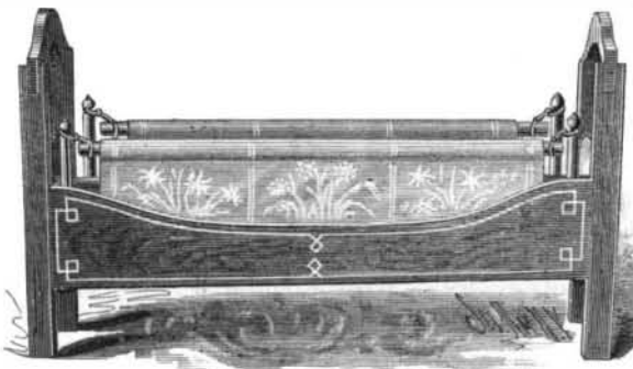
SHELLEY'S BEDSTEAD GUARD.

A simple device for preventing children from falling out of bed, and one which is also applicable to cots and lounges, or to the berths of river and ocean steamers, is represented in the accompanying illustration. It consists of guards, each of which is formed of a strip of canvas, cloth, carpet, hammock mesh, or other flexible material, either plain or decorative, attached on its longer sides to bars that extend from the head board to the foot board. Little posts are supported by the side rails or by the head and foot boards, with knobs or catches on their upper ends, for holding the rings or loops of cords connected to the top bars of the guards, to hold them in their raised position. Lift the rings from the tops of the little posts and the guard comes down, and may be pressed under the mattress out of sight, when the posts may be lifted out of the castings; or the whole guard will roll to-