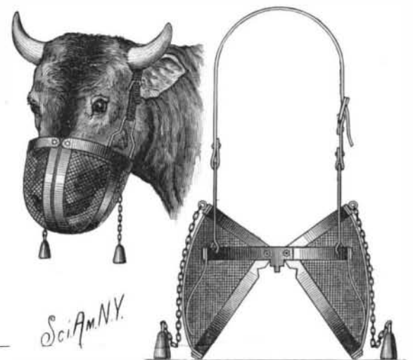
PRIOLEAU'S MUZZLE FOR CATTLE.

Through the Southern States, and in Florida particularly, there is very little grass for cattle and horses during the fall, winter, and early spring, and farmers would then like to give their stock the advantage of the grass in their orange groves and orchards, but this is not admissible, because the cattle would injure the trees. The same facts apply at some seasons in many other sec-