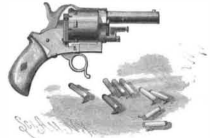
THE SMALLEST FIRING REVOLVER.

The very diminutive firearm illustrated in our engraving is the workmanship of Mr. Victor Bovy. It is shown in actual size; and of working revolvers, it is undoubtedly the smallest in the world. The dimensions are truly Liliputian; the total length, from handle to muzzle, is 1\frac{1}{2} inches, and the weight is something under half an ounce. The cartridges shown are also natural size, though only about a quarter of an inch in length, and the weight of shell, charge, and bullet is only a trifle over a grain. The charge consists entirely of fulminate, as the dimensions are too small to permit the use of powder. It is in all respects a perfect little instrument, and quite as complete as larger revolvers. There are six cartridge chambers, a self-cocking device, and a minute rod for discharging the empty shells. In spite of its pygmy proportions, its execution is quite comparable with larger arms. At a distance of ten inches it gave a penetration in wood of three-sixteenths of an inch, while at four and a half feet the bullet passed through a pane of ordinary glass. The