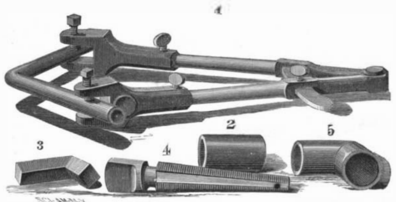
WINEGAR'S IMPROVED METAL TONGS.

An experiment of cleaning main water pipes of incrustations by means of chemicals was successfully accomplished last year in Leipzig. The main pipe between reservoir and the pump, 28 miles long and 15 1/2 inches in diameter, was covered with incrustations about one inch thick. The cleaning lasted two months, and during this period the main pipe was filled eight times with solution of hydrochloric acid, three times with solution of soda, and once with solution of chloride