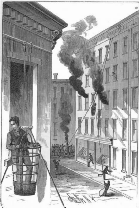
MACDONOUGH'S IMPROVED FIRE ESCAPE.

It is the merit of the invention that it scarcely needs explanation, since our illustration tells the whole story at a glance. A strong metallic cable is stretched along the front of the building just below the cornice. Movable rings support vertical cables, which are connected in pairs by means of iron cross bars. These bars are provided with two friction wheels at each end between which the cables pass. A strong hook on the cross bars permits the suspension of a metallic basket, which,