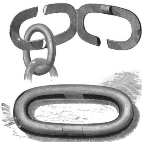
CLAY'S IMPROVED SPLIT LINK.

The laborer at the discharging end of the line has full control over the train, and can stop, start, and reverse it at will, as can also the man at the other or loading end. There are two trains at Glynde, but only one is at present used, that being found sufficient to deliver 150 tons of clay per week at the station. The trains need no attention when running, as they are governed to run at the same speed both on rising and falling gradients. An automatic block system is provided, so that as many as twenty trains can be run on the line without the possibility of collision. The telpherage line at Glynde being the first erected is still capable of improvement in detail, but it successfully demonstrates Jenkin's proposals for working the equivalent of a wire rope railway by electricity instead of by the teledynamic