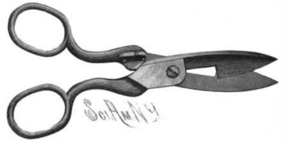
RODER'S BUTTONHOLE CUTTER.

The buttonhole scissors shown in the cut are so constructed that they can be adjusted very easily for buttonholes of a certain size. Each blade is formed with a notch or recess, which constitute the cutting parts. One blade is provided, adjacent to the diagonal edge (each blade has a diagonal edge formed on the rear part of the blade proper) of the other, with a button having a pin mounted to turn in the blade and a handle wing. The button is eccentric in relation to its