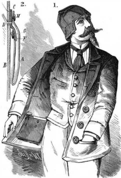
HELLER'S COMBINED DETACHABLE POCKET AND CAP.

An invention recently patented by Mr. Andrew Heller, of 2095 Madison Avenue, New York city, provides a pocket for coats which can be readily detached and used as a cap. To the inner surface of the coat is sewed a piece of fabric, C, having a slot coinciding with the pocket slot, D. The edges of the slot in the piece are sewed to the coat at the edges of the slot, and the upper edge of the piece is sewed to the coat, the lower edge forming the tongue, F. The buttons, H and G, are sewed to the piece as shown in Fig. 2, and the sides of the pocket, A, are provided, at their upper edges,