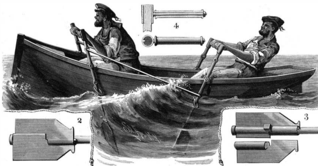
DOSCHER'S ROWING APPARATUS.

Fixed to the shafts of the oars are pins which enter sockets of plates secured to the gunwale of the boat, so that the oars may swing fore and aft on the pins as centers. The blade of the oar (Figs. 2 and 3) is made in two wing sections, which have elongated eyes of about half the length of each blade. These blades are held on the oar shaft by a collar at the lower end, and are prevented from moving upward by a pin. On the oar shaft is a stud, against the sides of which strike shoulders on the wings when the latter are opened or lie in the same plane; and each wing is made with a side extension which bears against the outer face of the other. The stud prevents the folding of the outer edges of the wings closely together, so that at the beginning of the stroke they will open certainly and promptly, and the extensions form together an overlapping brace the full length of the blade, which may thus be made very light and cheap, and still have sufficient resistance on the pulling stroke of the oar. The oar handles (Fig. 4) are made with a long ferrule, having a feather entering a slot in the end of the oar shaft, and to which is fixed a rod carrying a hand roller. The handles extend thwartships, so that they may be