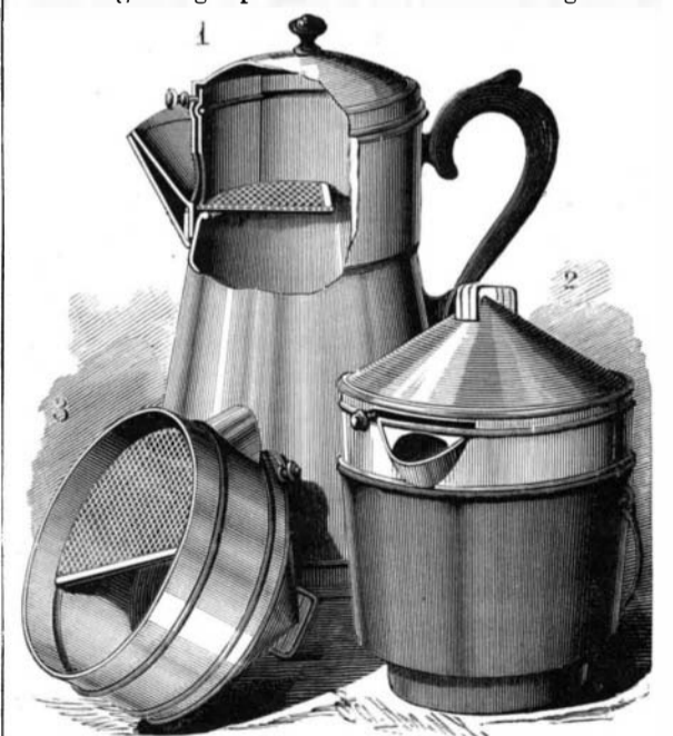
GOODALE'S COVER FOR COOKING UTENSILS.

The engraving represents a cover for cooking kettles