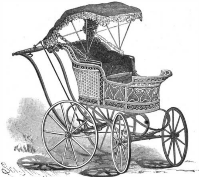
RIBBLE & SAMMIS' BABY CARRIAGE.

four torpedoes, and cost $35,000 each. Ten vessels somewhat larger are now being constructed. The best type of sea-going torpedo boat should be about 131 ft. long or less, and about 12 ft. wide; she should be manned by 15 to 18 men, should carry provisions for 12 to 15 days, and coal for 1,500 to 2,000 miles. She should be able to steam 22 to 25 miles an hour, and be