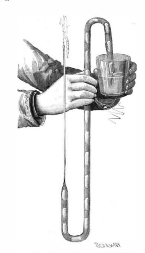
EXPERIMENTS WITH THE SIPHON.

pipe passing along the line of tanks, having a regulat- liquid behind it great velocity, and when it reaches the small opening at the end of the tube it is suddenly checked, producing considerable pressure—pressure enough to throw a few drops of the liquid ten or fifteen feet high, easily seen when the drops strike the ceiling of the class room.