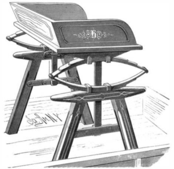
HODGESS' SPRING SEAT FOR WAGONS.

Make a wooden sign in the usual manner, and have a projecting moulding around it that projects one inch out from the face of the sign; now cut thin grooves into the moulding, one inch apart, allowing each cut to reach to the surface of the sign; in each of these grooves insert strips of tin, one inch wide, and long enough to reach across the signboard; when so arranged take out the strips of tin, and place them