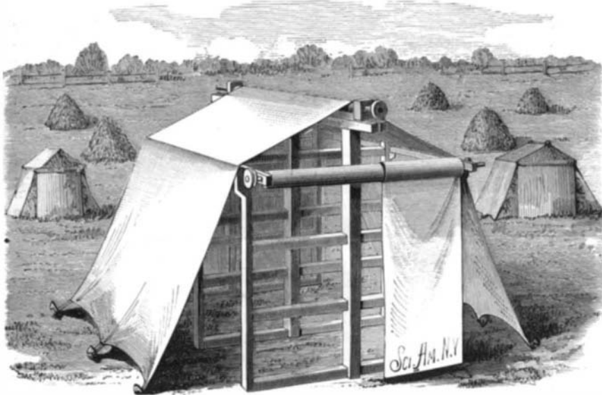
KEYS & SLAUGHTER'S PORTABLE BARN.

The frame of the barn is formed of transverse sections, each of which is composed of a center post and two side posts, united by horizontal bars. The central top beam is mortised to fit tenons on the center posts, and its ends project beyond the frame, and are provided with short standards in which a long roller is journaled. The roller is turned by a pulley at one end. A piece of sail cloth, rubber, or other suitable material is secured at its middle to the roller. At the top of each side post is a notched bracket, in which the side top bars, which also project beyond the ends of the frame, are held. In the ends of the bars are journaled end