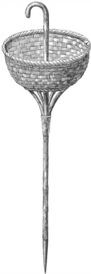
A RUSSIAN FLOWER BASKET.

The accompanying illustration gives a good idea of a unique style of flower basket which was shown at the late