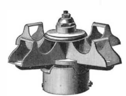
SCHWENDLER'S CLOTHES REEL.

Mounted on an upright is the reel, the track plate of which fits as a cap on top of the post. In the upper surface of this plate is a circular grooved track, fitted loosely within which are anti-friction rollers which run on the bottom of the groove and against the under surface of the head plate, which carries the wooden arms of the reel. This plate is formed with a circular rim on its under side, that receives the upper end of the track plate freely but snugly within it, to protect the rollers and track from rain and dirt. The track plate is formed with a tapering hollow upright projecting up through the eye of the head plate, which rotates around the upright and is centrally guided thereby. The head plate is constructed with radial sockets for holding the ends of the arms. The several working parts are held together by a bolt and nut, as shown in the engraving.