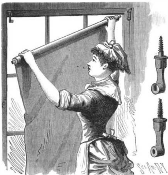
MULLEN'S SHADE ROLLER HANGER.

The hanger is pivoted to a screw, the construction of which is clearly shown in the side views. The screw is screwed into the top piece of a window frame, one hanger being placed at each end. The lower end of one hanger is formed with a squared socket, open at the top, and in the other is a circular socket, these being designed to receive