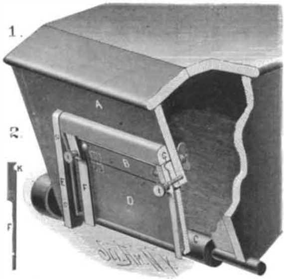
FEEDER FOR MILLS, PURIFIERS, ETC.

The apparatus is also applicable to the feeding of substances of different specific gravities, from wheat to the lightest stock made in a mill.