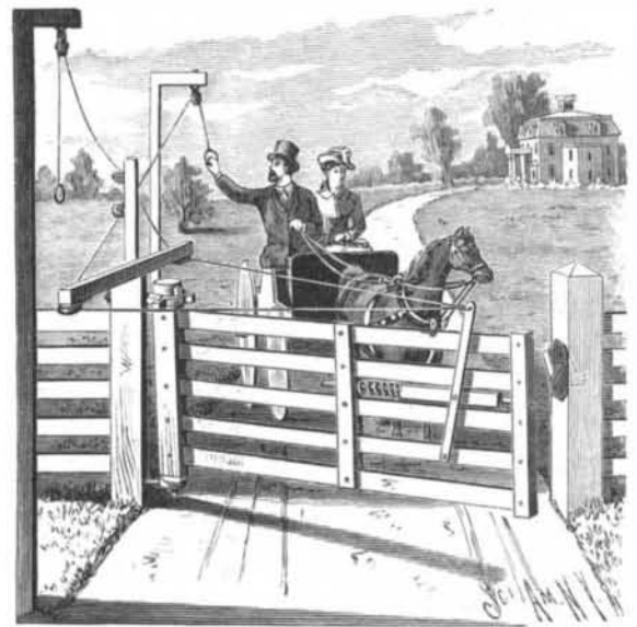
HAMILTON'S IMPROVED GATE.

To the inner side of the latch post is attached a plate having an angular slot formed in it, with a flange along its inner edge. The flange serves as a stop and guide to the end of the fastening bolt as the gate swings shut, the bolt enter-