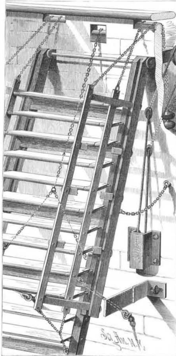
CHASE'S FOLDING STAIRCASE.

An automatically folding staircase or ladder that can be used as a fire escape, for hoarding vessels, etc., has recently been patented by Mr. Charles H. Chase, P. O. box 2,035, New Orleans, La. Our engraving shows the device attached to the side of a vessel. Two longitudinally grooved side bars, united by a series of transverse pieces, are hinged to the side of the vessel. Sliding in the grooves and united by cross pieces are two bars, to which is attached a chain, the upper end of which passes through an opening in the side of the ship, and is secured to a shaft placed directly before the opening. A brace rod connects the side bars with the