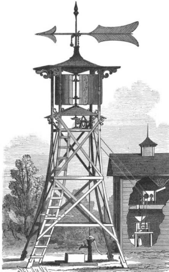
A NEW WIND ENGINE.

The accompanying engraving represents a new wind motor, which consists of a horizontal wind wheel partly surrounded by a semi-cylindrical shield. The shield is connected with the vane above by a vertical shaft that is independent of the wheel shaft. A novel governing device is attached to, and is directly opposite, the shield. When the