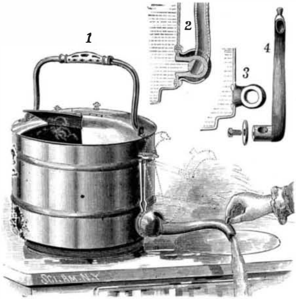
SCHOENING'S IMPROVED TEA KETTLE.

Clips are provided for holding the spout in the vertical or inclined position. Fig. 2 of the engraving is a vertical section of the spout, showing the faucet connection closed; Fig. 3 shows the body of the faucet, and Fig. 4 shows the spout with the faucet plug attached.