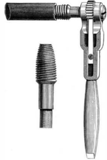
PRATT'S SHELL EXTRACTOR.

The inventor furnishes the following directions for operating the extractor: