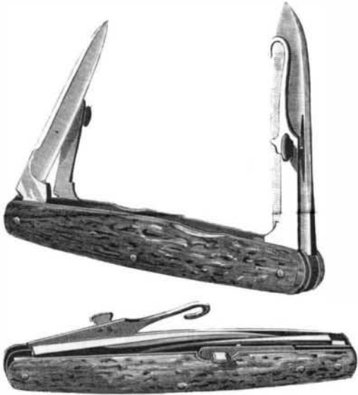
DU BOIS'S IMPROVED POCKET KNIFE.

The greatest defect of the ordinary pocket knife lies in the means provided for opening the blades. This is particularly noticeable in knives with strong back springs. Broken finger nails and sore fingers, with an occasional cut, bear witness to the desirability of an easier way of opening the blades. Our engraving shows an improvement designed to obviate this difficulty, and to facilitate opening the blade by substituting the pressure of the ball of the thumb for that