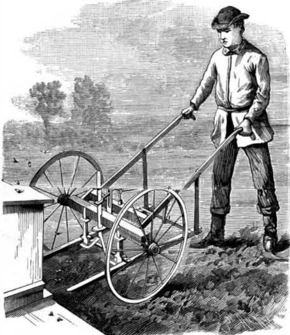
THOMPSON'S BEEHIVE TRUCK

The engraving shows a very compact, convenient, and handy truck or hand cart, designed specially for the trans-