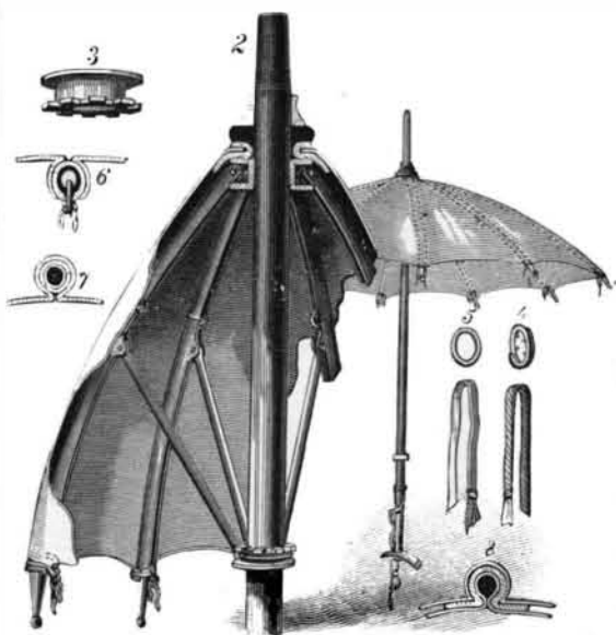
LOCKLING'S IMPROVED UMBRELLA.

One of the interchangeable covers adapted to fit a single frame is slipped over the top of the stick of the frame, the aperture in the cover passing over the end of the stick being re-enforced with a ring of leather. This ring fits down upon the notch plate and is held in place by means of a rubber ring, which is sprung into place and confined under a metallic collar upon the stick, so as to bear firmly upon the ring of the cover, as shown in Fig. 2 in the engraving. The ring of the cover it kept from turning upon the handle by