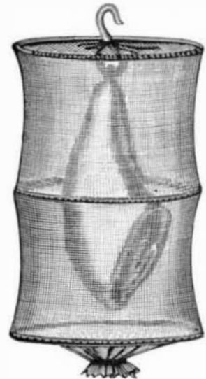
PORTABLE MEAT SAFE.

This is a very simple invention which will prove exceedingly useful in summer to protect joints of meat from flies