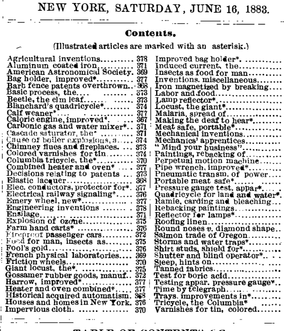
TABLE OF CONTENTS OF THE SCIENTIFIC AMERICAN SUPPLEMENT