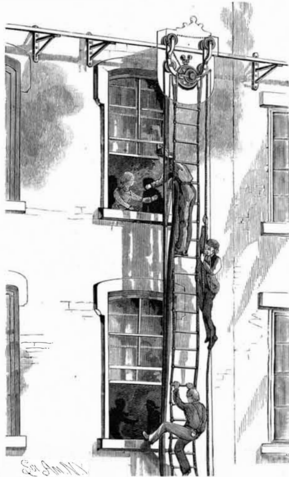
COPELAND'S FIRE ESCAPE.

A horizontal rail is attached to the building beneath the