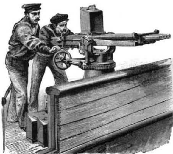
THE NORDENFELT GUN.

The four barrel gun is illustrated by the perspective view.