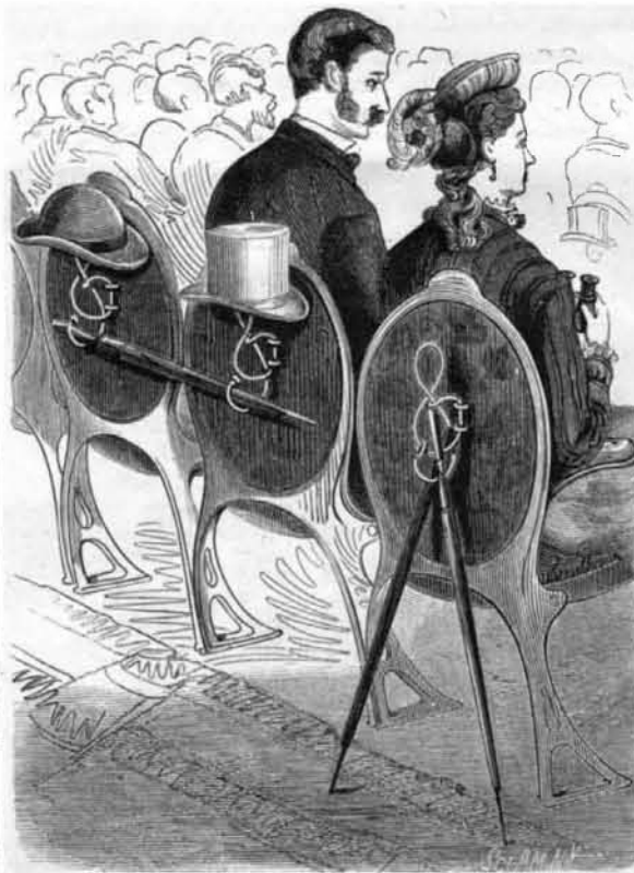
LINDSEY'S HAT HOLDER FOR OPERA SEATS, ETC.

We give an engraving of a very simple, inexpensive, and efficient holder to be applied to the backs of opera seats, church pews, seats of public halls, to the sides of railroad coaches, and to be used wherever a thing of this kind is applicable. It is formed of Bessemer steel wire bent into the form of the treble clef in music, the straight portion being secured to the back of the seat by suitable fastenings, which permit of swinging it out for use or out of the way and against the back of the seat when not in use. The upper loop of the holder is capable of springing sufficiently to receive the brim of any hat, and the lower coil will receive an umbrella or cane, as shown in the engraving. The wire is in a single piece, and where it crosses itself is left free to move, so as