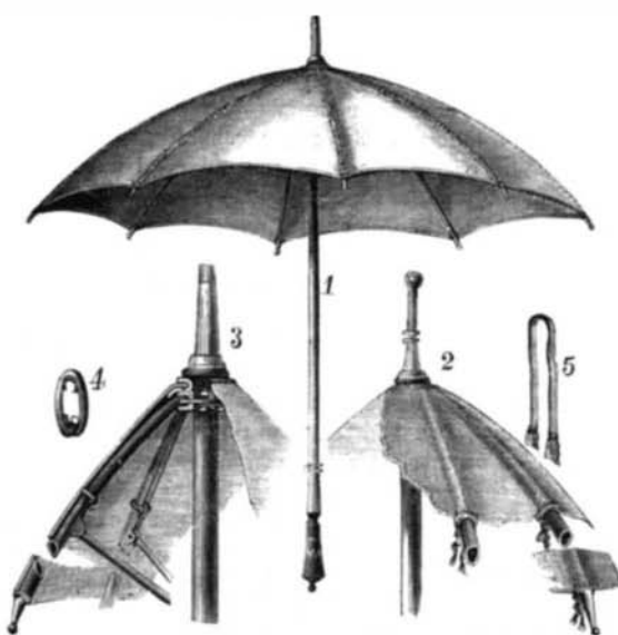
LOCKLING'S IMPROVED UMBRELLA.

The engraving shows an improvement which permits a quick, ready change of the cover of a parasol or umbrella, so that with a single frame a number of covers of different materials and variety of colors may be used. It has the special advantages not only of economy, by enabling a worn-out cover to be readily replaced, but of enabling ladies to provide themselves with parasol covers corresponding with each change of suit. The interchangeable covers adapted to fit a single frame are slipped over the top of the stick of the frame, the aperture in the cover passing over the end of the stick being re-enforced with a ring of leather. This ring fits down upon the notch-plate and is held in