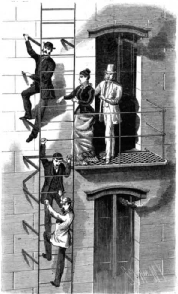
WICKERSHAM'S FIRE ESCAPE.

Further information may be obtained by addressing the