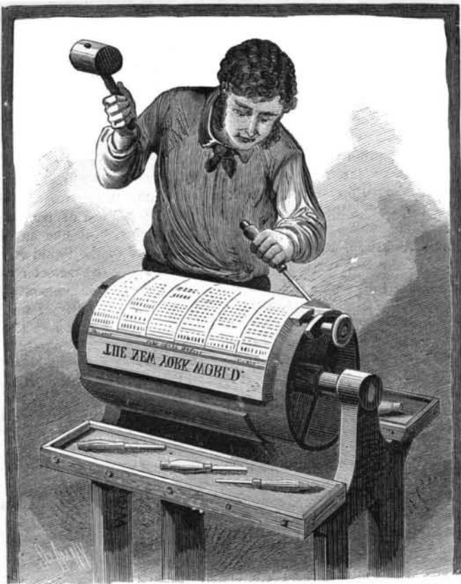
THE "NEW YORK WORLD."—TRIMMING THE STEREOTYPES.

so diffident are English women that last year only fifty-nine accepted these offers, and now the society, through Macmillan's Magazine , calls for "respectable and capable" loverless but not unlovely women to go forth for love of God, love of man, or love of money, as missionaries, as philanthropists, as housekeepers, or as helps, to subdue the colonies and replenish them, lest England become a kingdom of calico. There is no chance for an immigration of men; Englishmen even go to America for wives. The good women of England, therefore, standing on the census and seeing 900,000 more petticoats than pantaloons on the island, already behold a greater catastrophe than Macaulay's New Zealander is to see—a land without husbands!