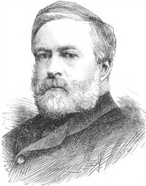
SIR CHARLES WYVILLE THOMSON.